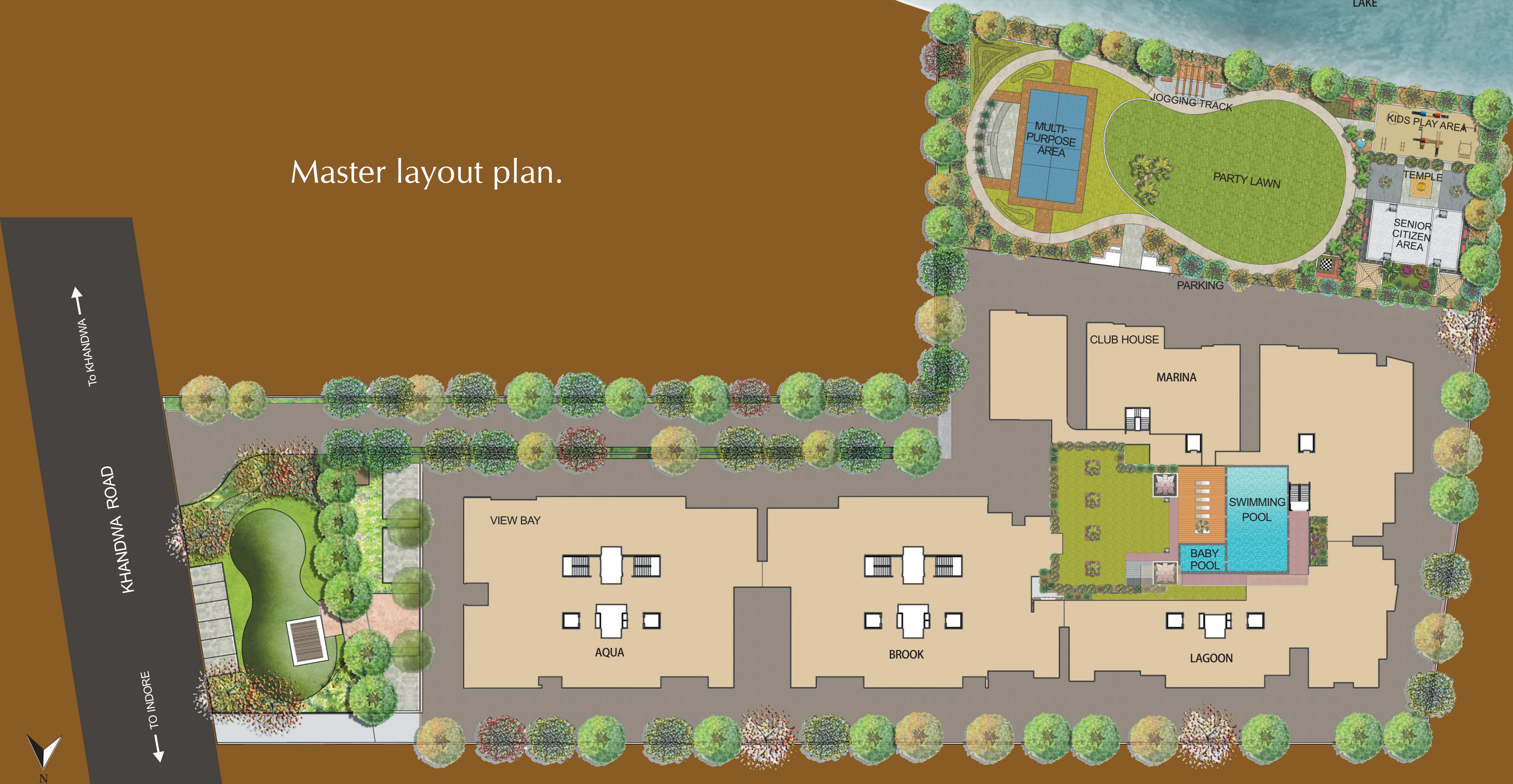
Master layout plan.